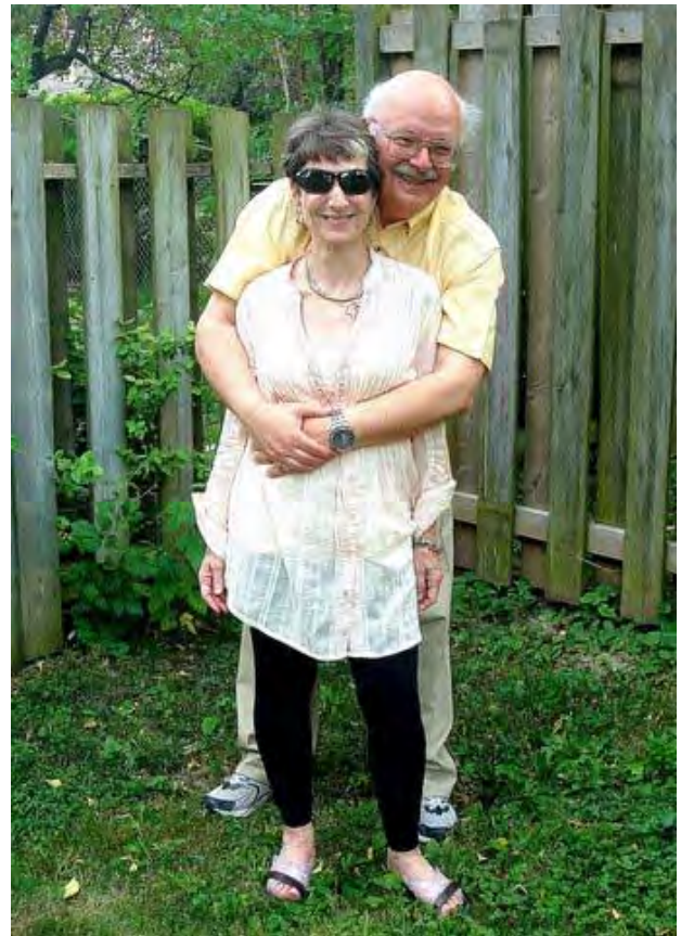
Looks like everyone was feeling pretty good after the sun subsided. "Strike a Pose!"