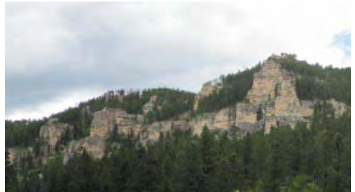
2 Spearfish Canyon shots ...above and below