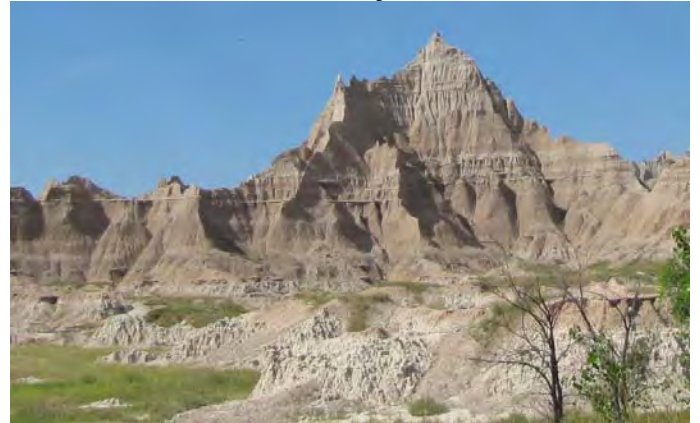
Badlands above ....

Record heat waves were not just seen/set in Toronto.