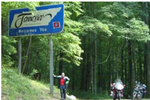
Our home base was Robbinsville N.C.