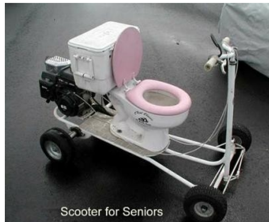
Scooter for Seniors