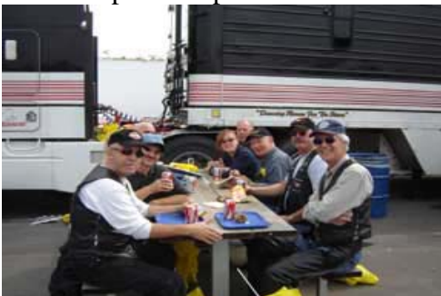
Eating hamburgers in Hamilton