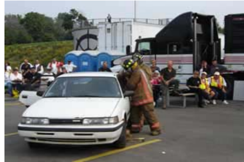
Jaws of life demo