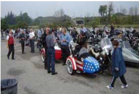
1 st check point stop