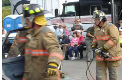
Our hero's at scenes of accidents