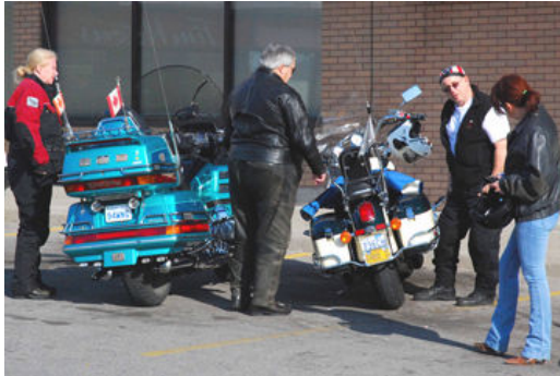
Everyone met at the Tim Horton's to start.