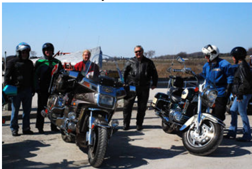
Look at all the smiles....after an amazing breakfast all were ready to ride!