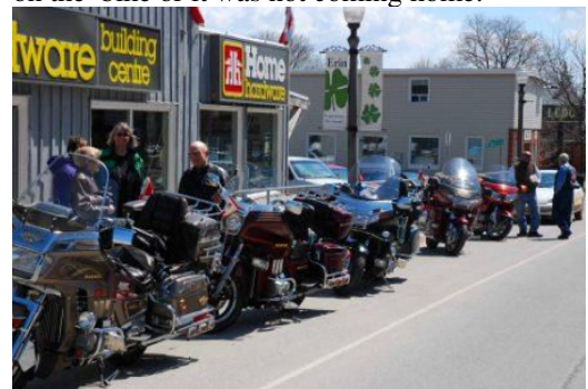
We parked in Erin and got ready for lunch