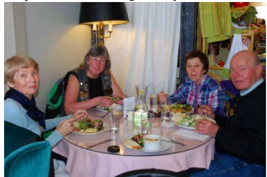
We had a great lunch...would go back again.