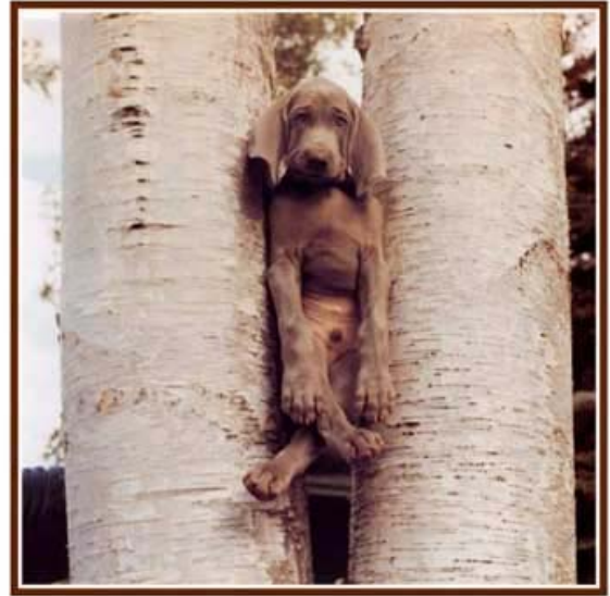
Some days we just get stuck, and bogged down. Some days all you can do is smile and wait for someone to kindly remove your butt from the hole you find it wedged into.